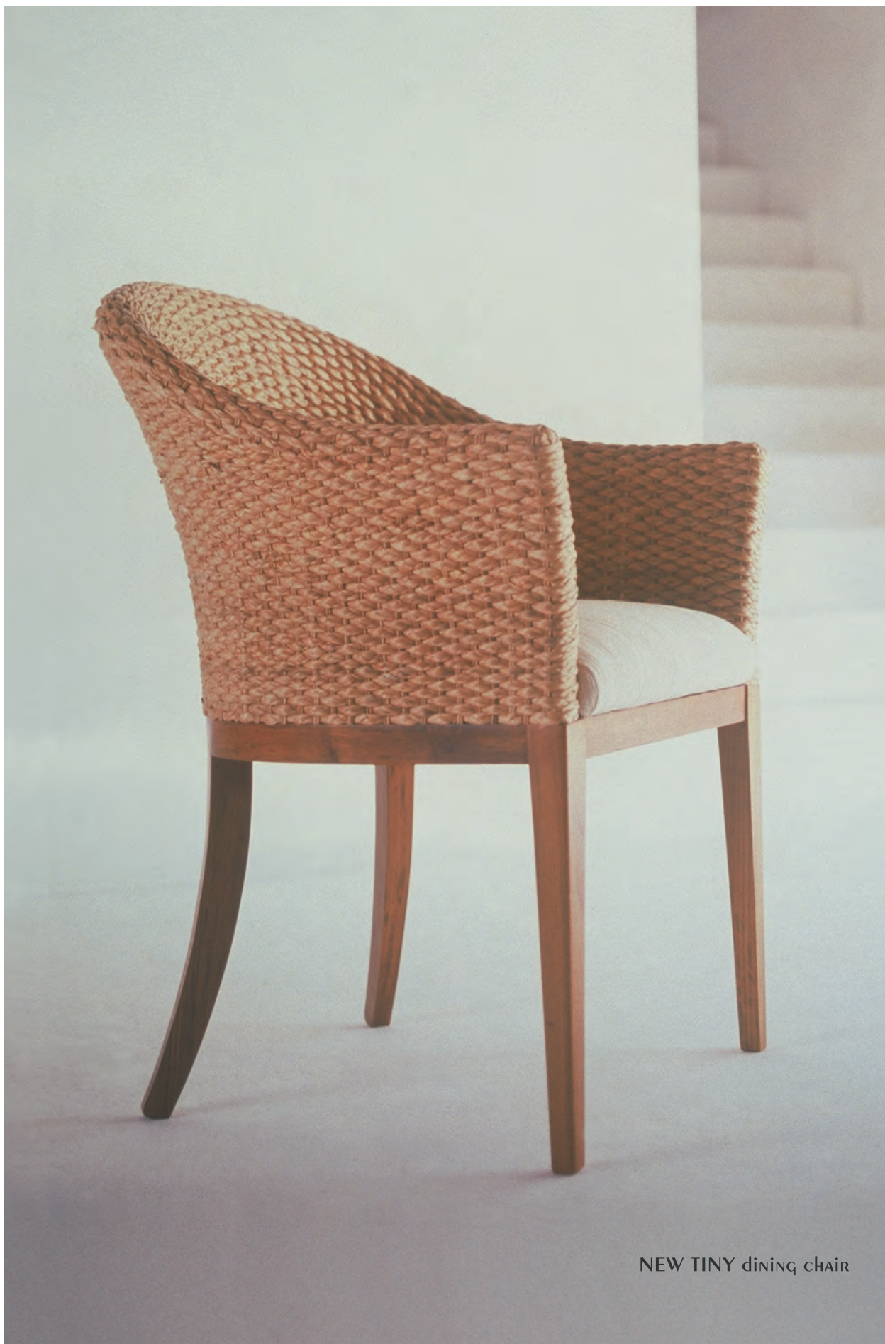
NEW TINY dining chair