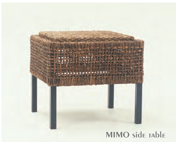
MIMO side table