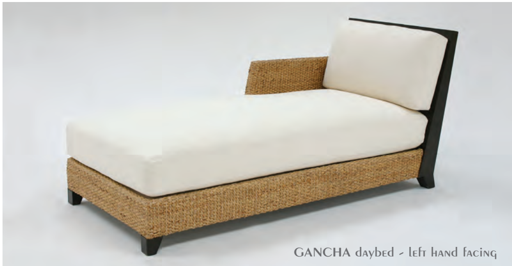
GANCHA daybed - left hand facing