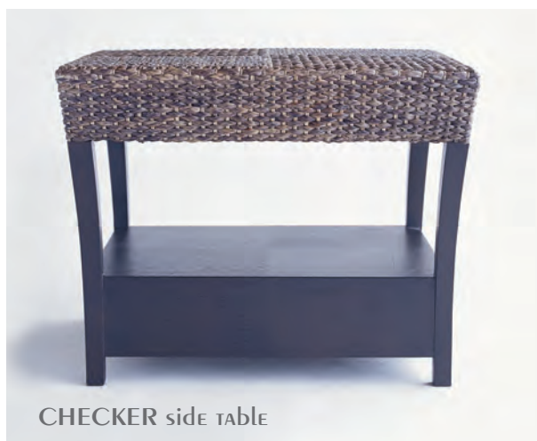
CHECKER side table