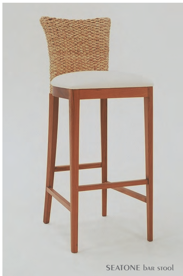
SEATONE bar stool