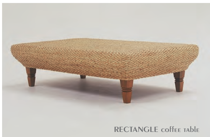
RECTANGLE coffee table