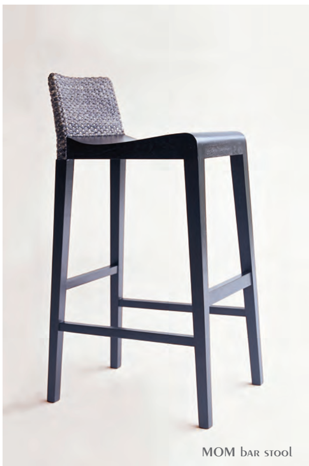
MOM bar stool