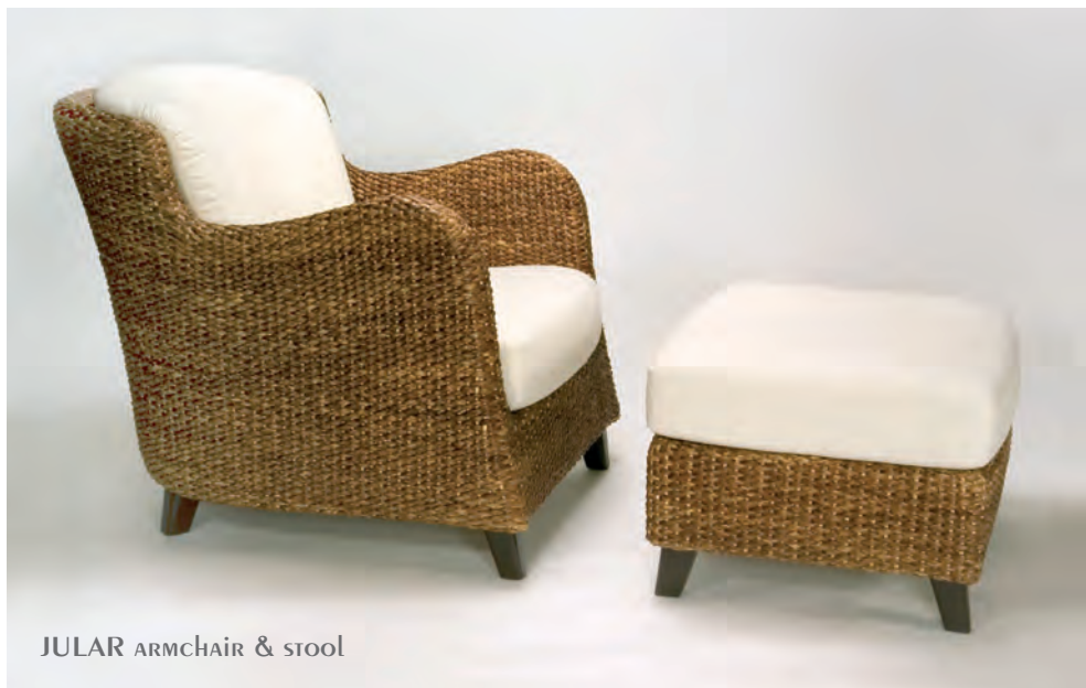
JULAR ARMCHAIR & STOOL