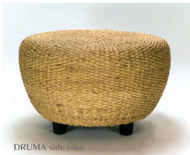
DRUMA side table