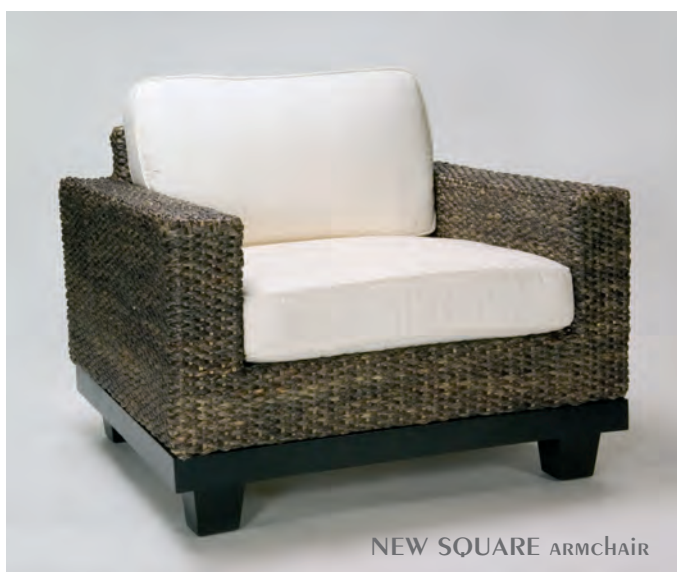
NEW SQUARE ARMCHAIR