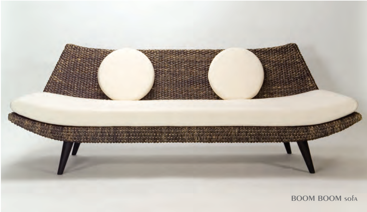
BOOM BOOM sofa