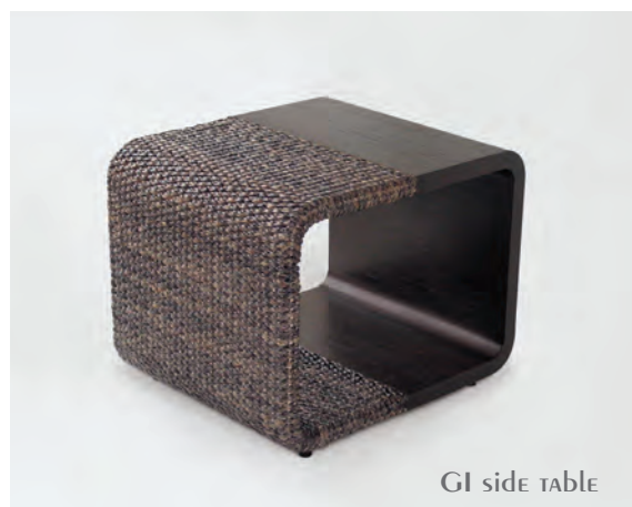
GI side TABLE