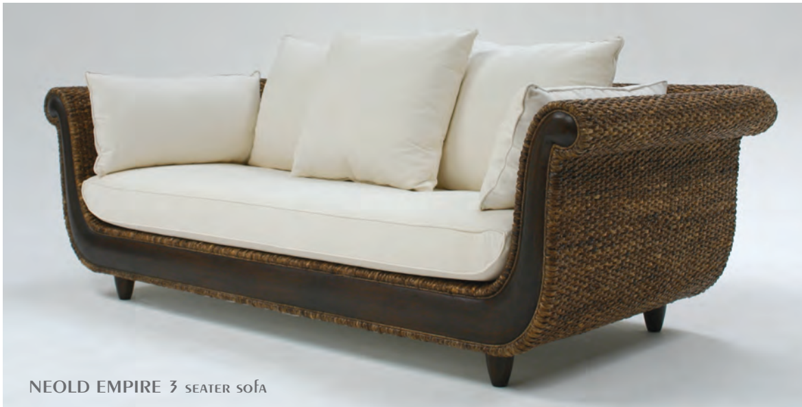
NEOLD EMPIRE 3 SEATER SOFA