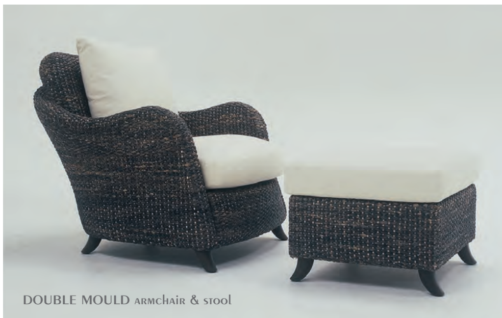
DOUBLE MOULD ARMCHAIR & STOOL