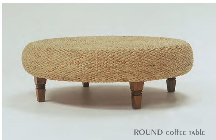
ROUND coffee table