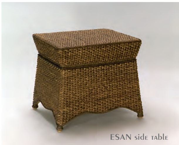
ESAN side table