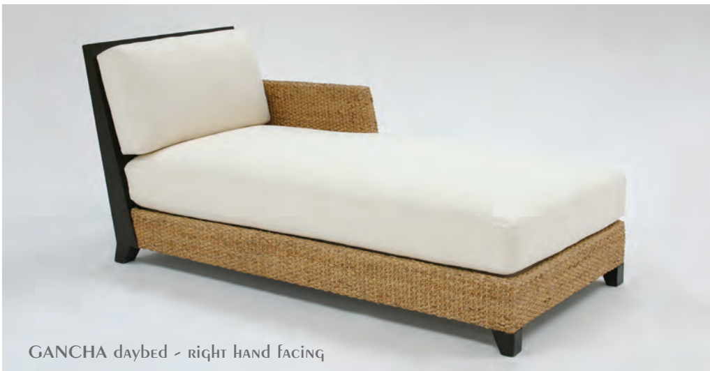
GANCHA daybed - right hand facing