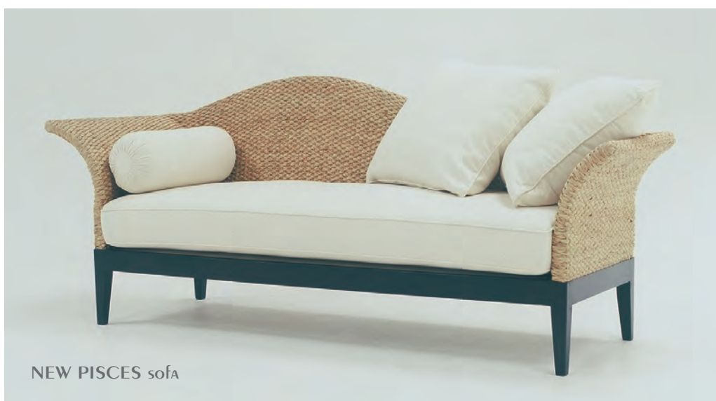
NEW PISCES sofa