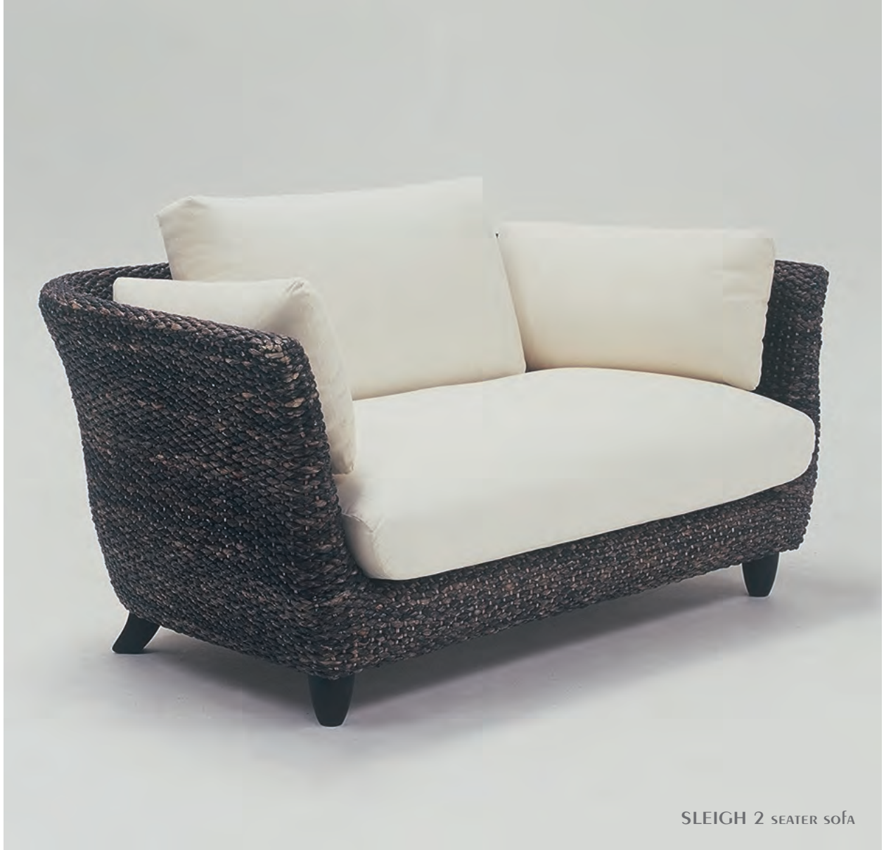
SLEIGH 2 SEATER SOFA