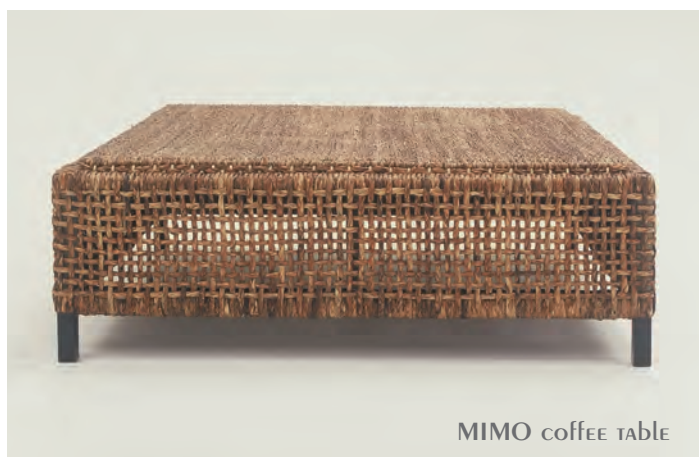
MIMO coffee table