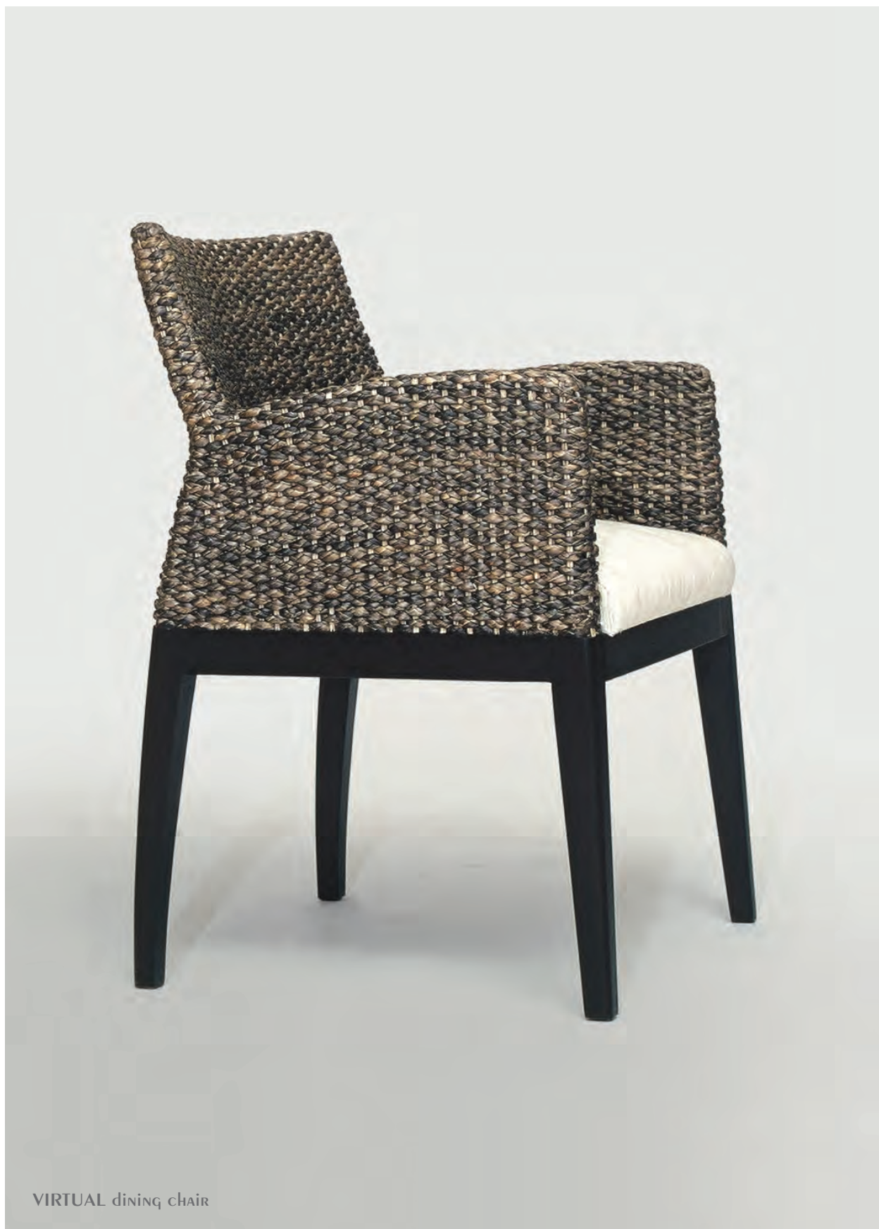
VIRTUAL dining chair