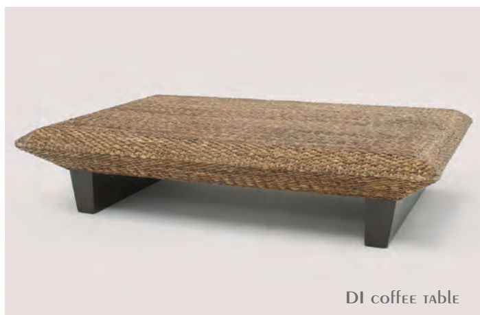
DI coffee table