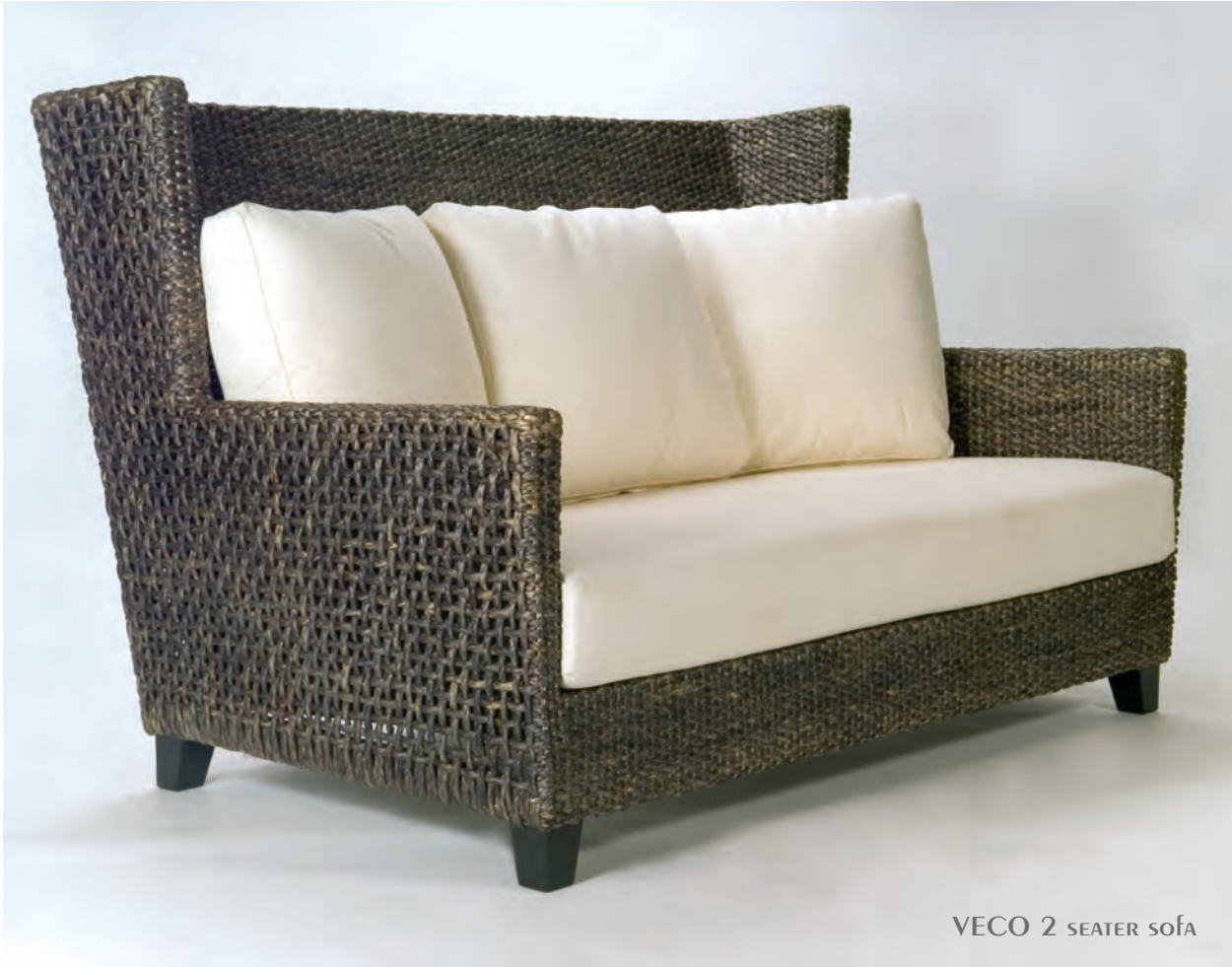
VECO 2 SEATER SOFA