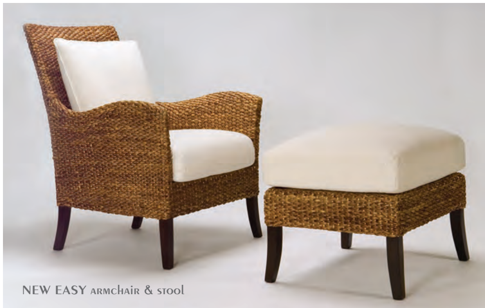
NEW EASY ARMCHAIR & STOOL