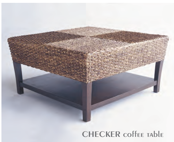
CHECKER coffee table